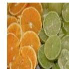
VITAMINS AND NUTRITIONALS