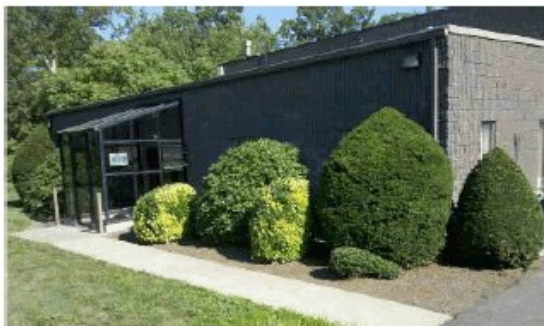
Main Office located in Ringwood, New Jersey